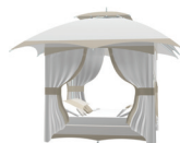
canopy vector vent